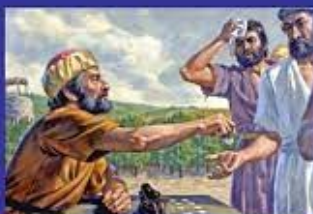
The Parable of the Vineyard Workers

Alleluia, alleluia! Open our hearts, O Lord, to listen to the words of your Son. Alleluia!